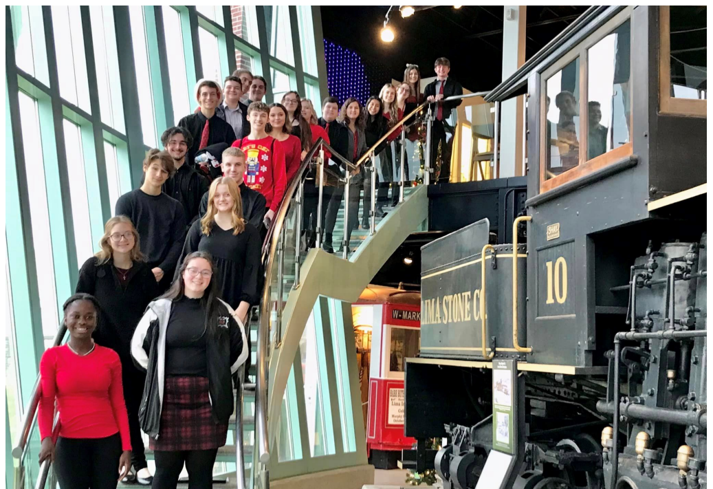
The Varsity Singers kicked off their holiday season on December 1st at the Allen County Museum's Christmas Tree Festival!